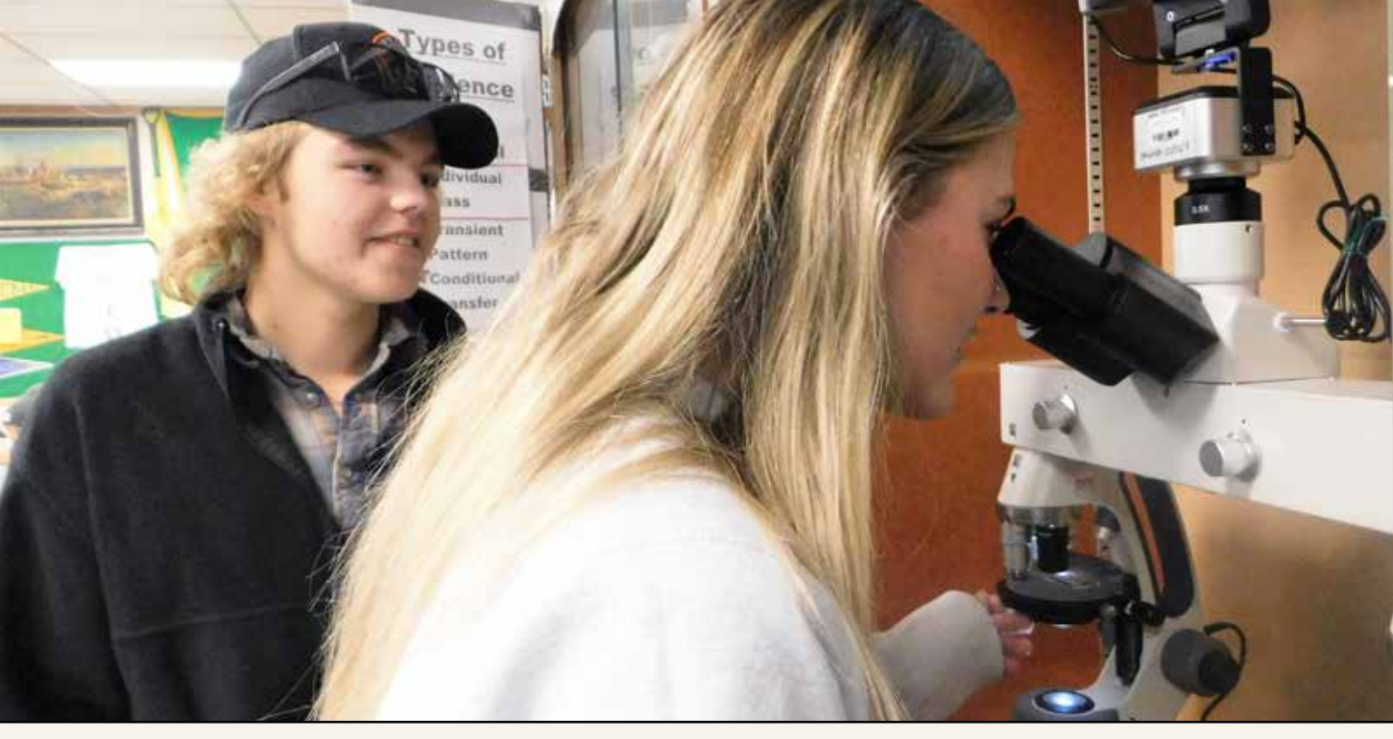
CMR students use advanced microscopes to study and compare samples of physical evidence in forensic classes.