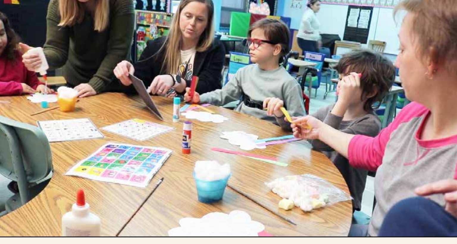
Alternative writing tools allow nonverbal students to communicate in new and powerful ways.