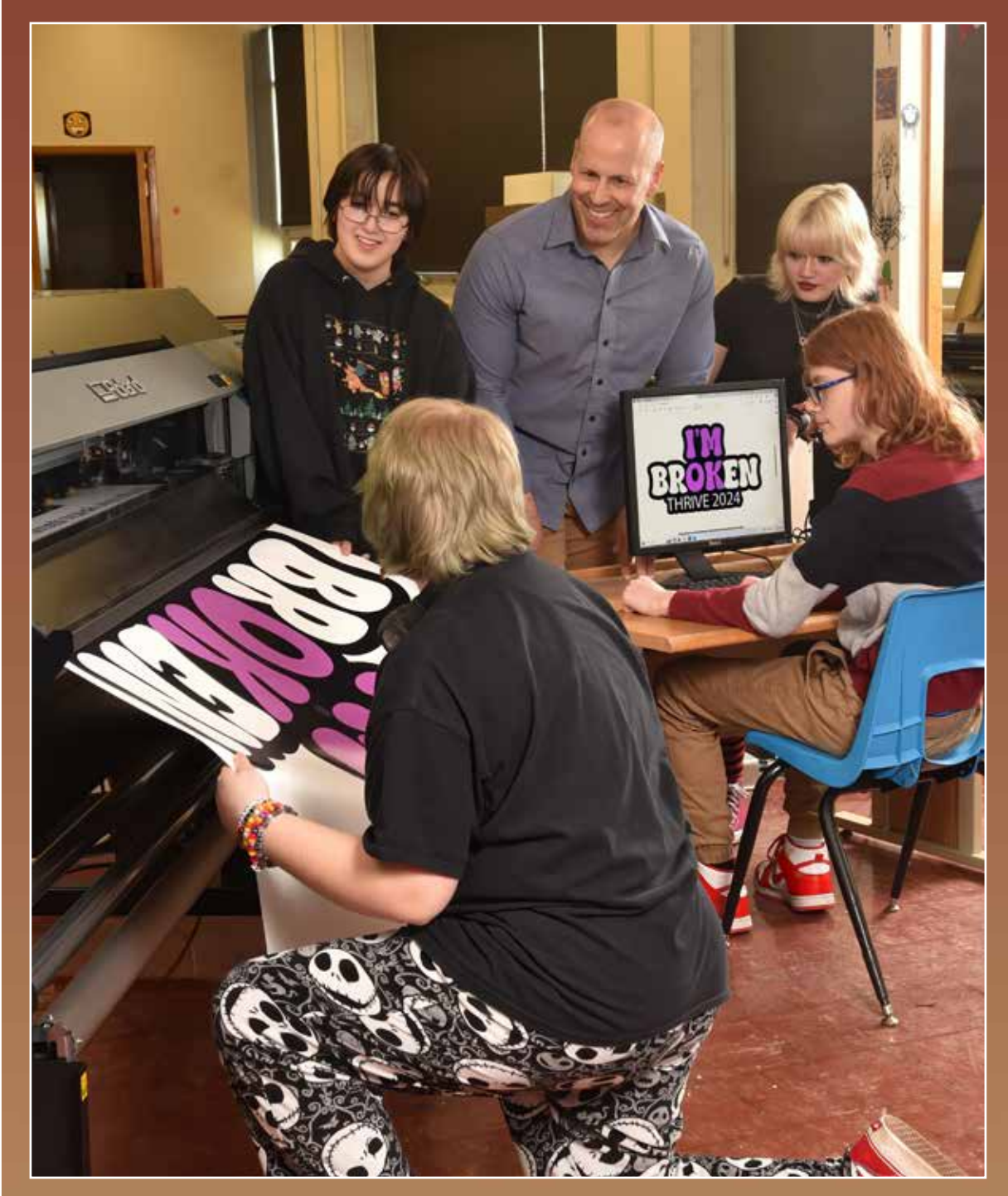
ANNUAL REPORT 2024